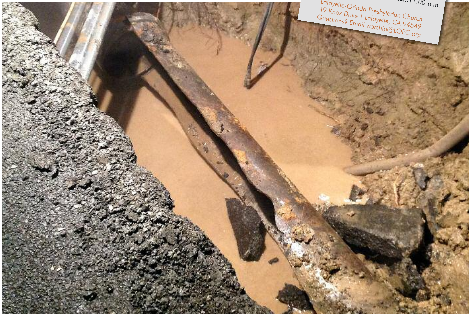
A 66-year-old water main on Reliez Station Road ruptured with a 15-foot-long break on Nov. 27.