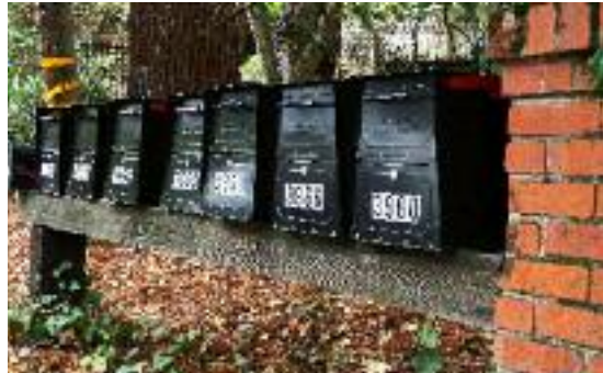
Locked mailboxes Veterans Memorial Hall.